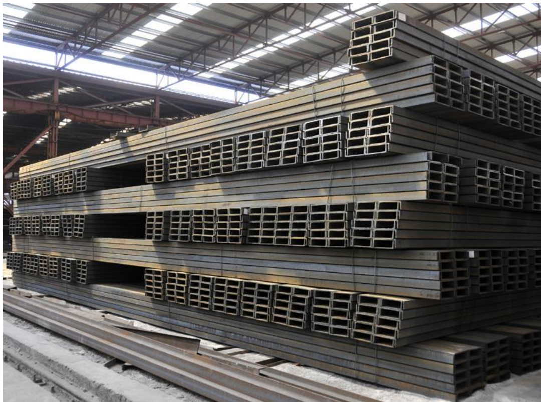
◆ Application Place