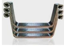
STEEL SHEET PILE