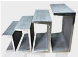
U CHANNEL STEEL