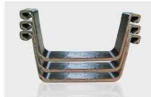
STEEL SHEET PILE