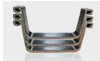
STEEL SHEET PILE